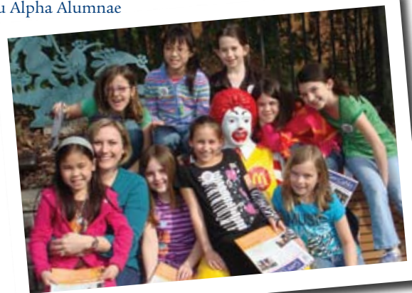
Copley-Fairlawn Brownie Troop 430 toured RMH in April.