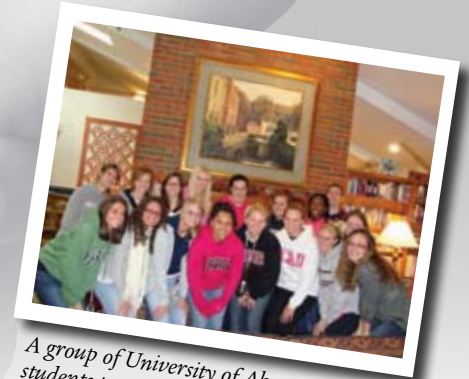
A group of University of Akron nursing students toured the House.