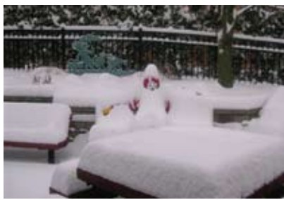
Aren't you glad spring is here??

Please clip your label and mail it to us, noting your request.