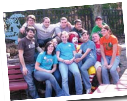
The University of Akron students, all members of the Chapel, came to Ronald McDonald House and did spring cleaning. They gave up their spring break time to perform community service.